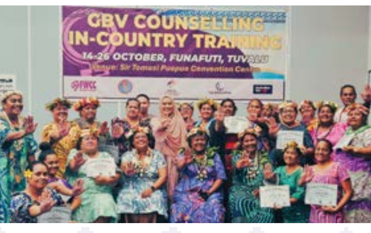
A significant milestone has been reached in the work to eliminate violence against women, girls, and children in Tuvalu with the completion of the Gender-Based Violence Counsellor Training by the Fiji Women's Crisis Centre in the capital. Funafuti from 15th to 25th