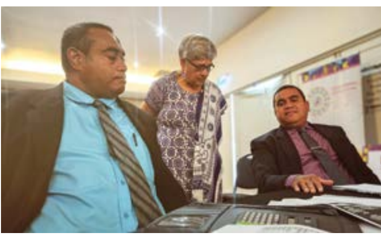
FWCC led a dialogue session with the chairpersons of Provincial Councils on the National Action Plan to eliminate all forms of violence against women and girls.