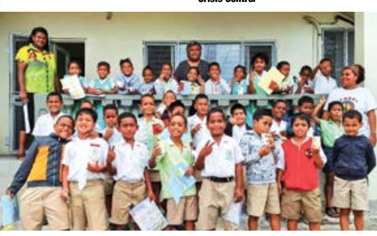
Students of St Marcellin Primary School visit FWCC and learn about good and bad touches.