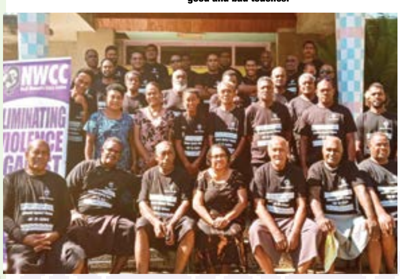
51 men from Sikituru completed week-long awareness sessions by the Nadi Women's Crisis Centre in June.