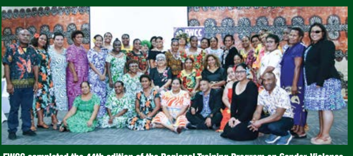
FWCC completed the 44th edition of the Regional Training Program on Gender, Violence Against Women and Girls, Human Rights and Development in August.

The new building at Naiyaca Subdivision and a vehicle were funded by the Australian Department for Foreign Affairs and