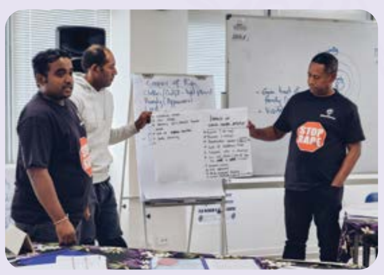
Homes of Hope Male Advocacy training