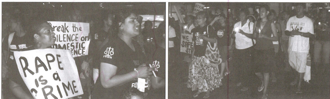
Women and children RECLAIMING THE NIGHT during the FWCC's annual march to mark International Women's Day