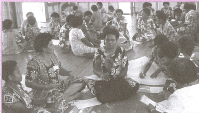
Women during the Vatuova workshop

She said the workshop was an eye opener to many of the women participants who later requested for more training on the issue of rape.