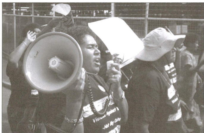
Women marching through Tavua town for the first time to mark International Women's Day