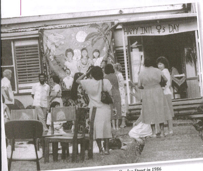
IWD celebration at the FWCC's old office on Gordon Street in 1986