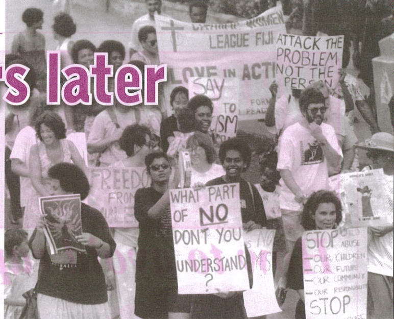
An International Women's Day march during the 1990s in Suva

(Adapted from the Division for the Advancement of Women, DPI, United Nations)