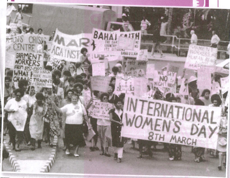
IWD march through Suva in 1987